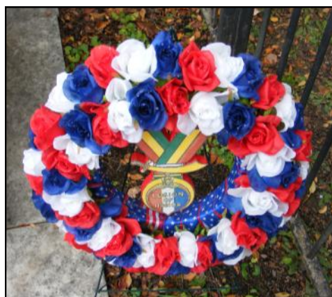
The wreath placed at the tomb of the Unknown Soldier of the American Revolution.

this fallen soldier who also "lies in honored glory, known but to God," was remembered as one who paid the supreme sacrifice more than a century before the