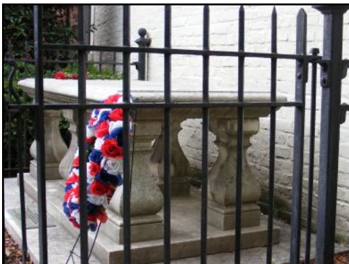
The tabletop monument over the tomb of the Unknown Soldier of the American Revolution.