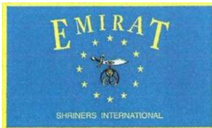
The flag of Emirat Shriners. Note the incorporation of the "ring of stars" symbolizing the European Community.

ment committee was extremely busy. With the help of the dispensation and charter committee and the jurisdiction alliance, two new Shrine clubs were added in Puerto Rico and six Shrine clubs were added in The Philippines. Shrine Clubs were also formed in Brazil, Bolivia, Germany, Italy and Australia. There are now a total of 53 Shrine Clubs and 1,193 new Shriners overseas. There is