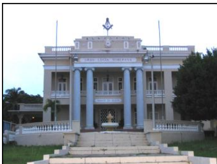
Grand Lodge of Puerto Rico