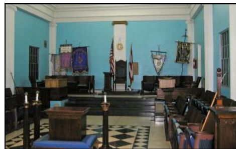
A Lodge Room in the Grand Lodge Building